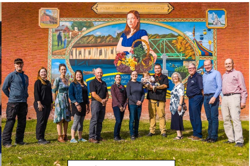
Mural inauguration event