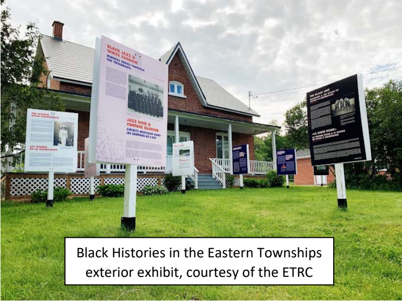
Black Histories in the Eastern Townships exterior exhibit